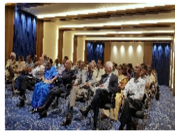
The Hall of Fame

The program was designed and conceived in such a way so as to keep lectures to a minimum and have more one-on-one interactions. Among the few lectures that we had were: